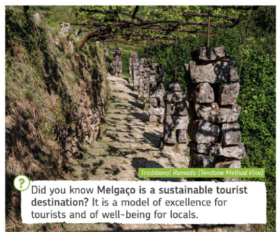
Traditional Ramada (Tendone Method Vine)

Did you know Melgaço is a sustainable tourist destination? It is a model of excellence for tourists and of well-being for locals.